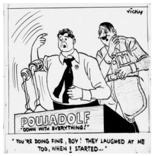
Figure 2: Pierre Poujade appears as "Poujadolf", Daily Mirror (6 January, 1956)

As Algeria's war of independence was in full swing, the French Empire was slowly losing control of Indochina, and the system's ineffectiveness was more apparent with every political new leader, Poujade's antiparliamentarianism and condemnation of those who were "selling off" France appealed to a great number of apolitical or weakly politicised voters. The Poujadist party was branded by